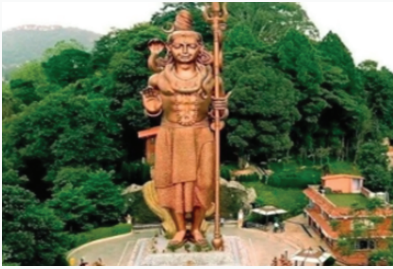
Statue of Lord Shiva