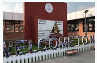
Arrival at Kathmandu